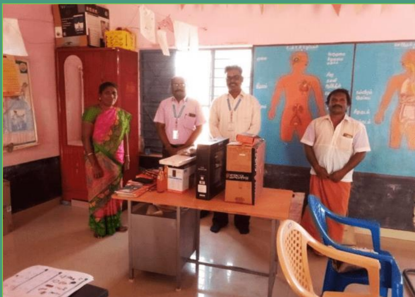
School HM, Councillor and Aquagri Representatives