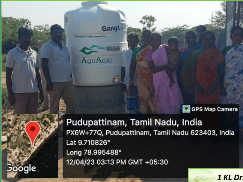
1 KL Drinking Water facility provided to Pudupattinam Villagers, Pudukkottai District

Drinking Water facility with 1 KL capacity to the village at Narendal and Pudhupatnam, Pudukkottai District to the Fishermen community was provided based on the request made by the villagers.