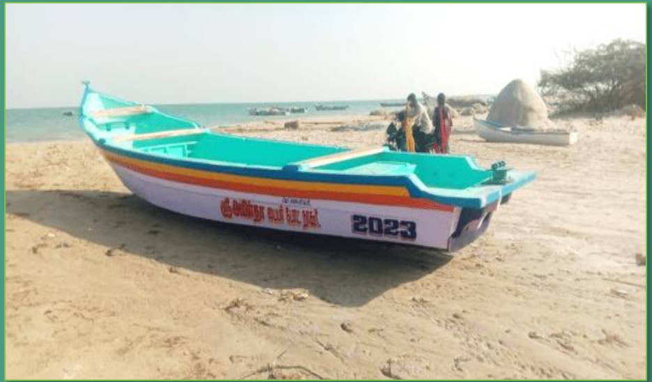
Row Boats provided to Fisherwomen in Narendal, Pudukkottai District and Tuticorin