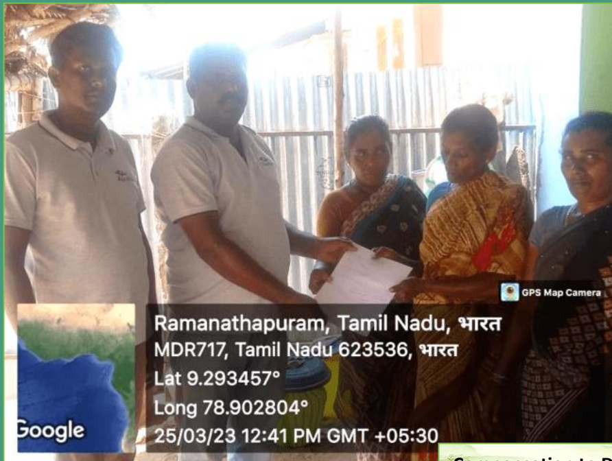
Compensation to Deceased Family:

Aquagri has supported two deceased fishermen family for their livelihood. Rs. 1 lakh each was supported to poor families for eradication of hunger and poverty.