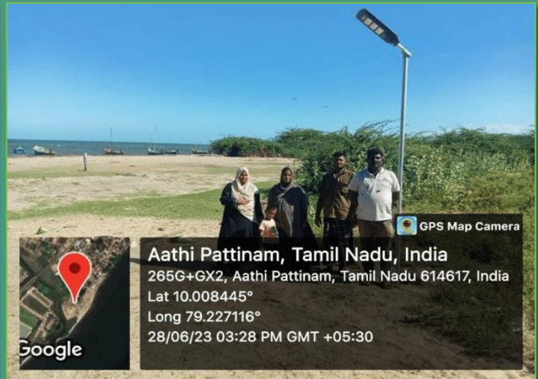
Solar Light installed in Arthipatnam Village, Pudukkottai.