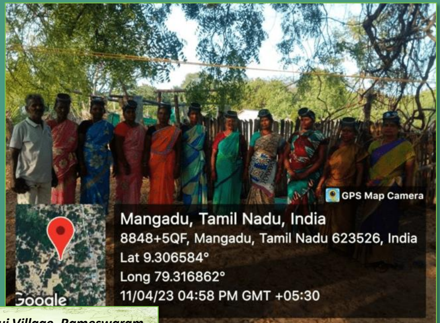
Goggles to Fisherwomen in Mangadui Village, Rameswaram

To support the fishermen community in drying the Seaweed, we have provided HDPE Sheet to support them in Adhipatnam Village, Thondi.