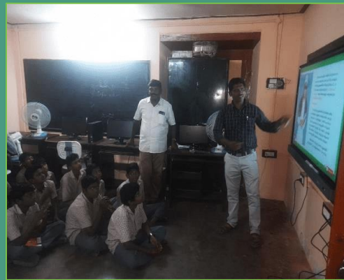
Teachers taking class with the help of Smart Board

CSI Deaf & Dumb School, Manamadurai requested us to provide Smart Board facility for their students who are deaf & dumb. This facility is mainly to teach the students more into visual communication on their study syllabus instead of Oral teaching method. This will enable the easy understanding of teaching classes in a better way. Donated Benq Smart Board with 65" as part of CSR activities for the year 2022-23