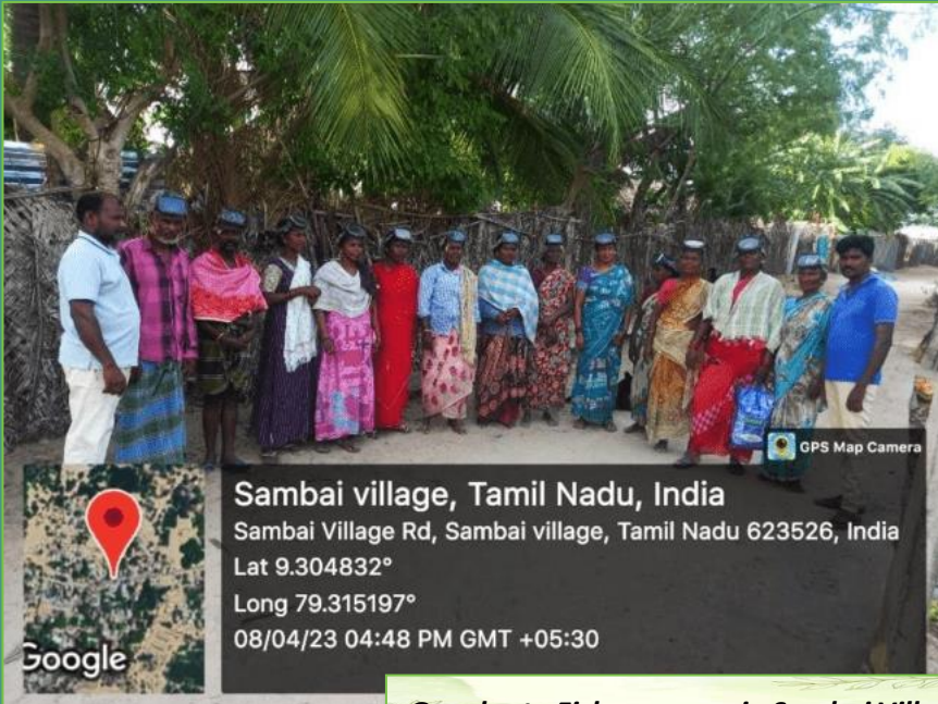
Goggles to Fisherwomen in Sambai Village, Rameswaram

Fisher-women, Women Cultivators of Sambai and Mangadu Village, Rameswaram, requested us to support by providing Goggles as the fisher-women go into the deep sea for Seaweed cultivation and harvesting. We have provided 20 Goggles in each village.