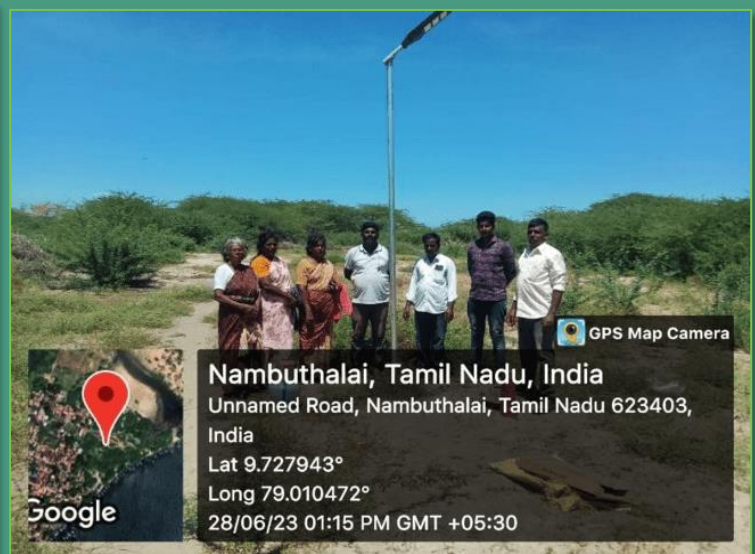
Solar Light installed in Pudupatnam Village, Pudukkottai.