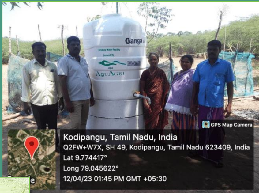
1 KL Drinking Water facility provided to Narendal Villagers,